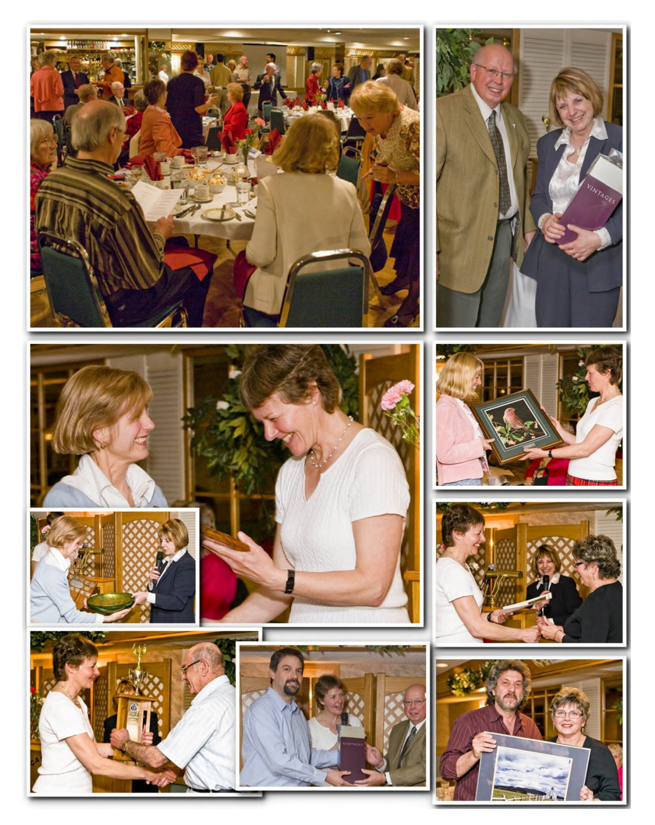
Banquet 11 May 2009